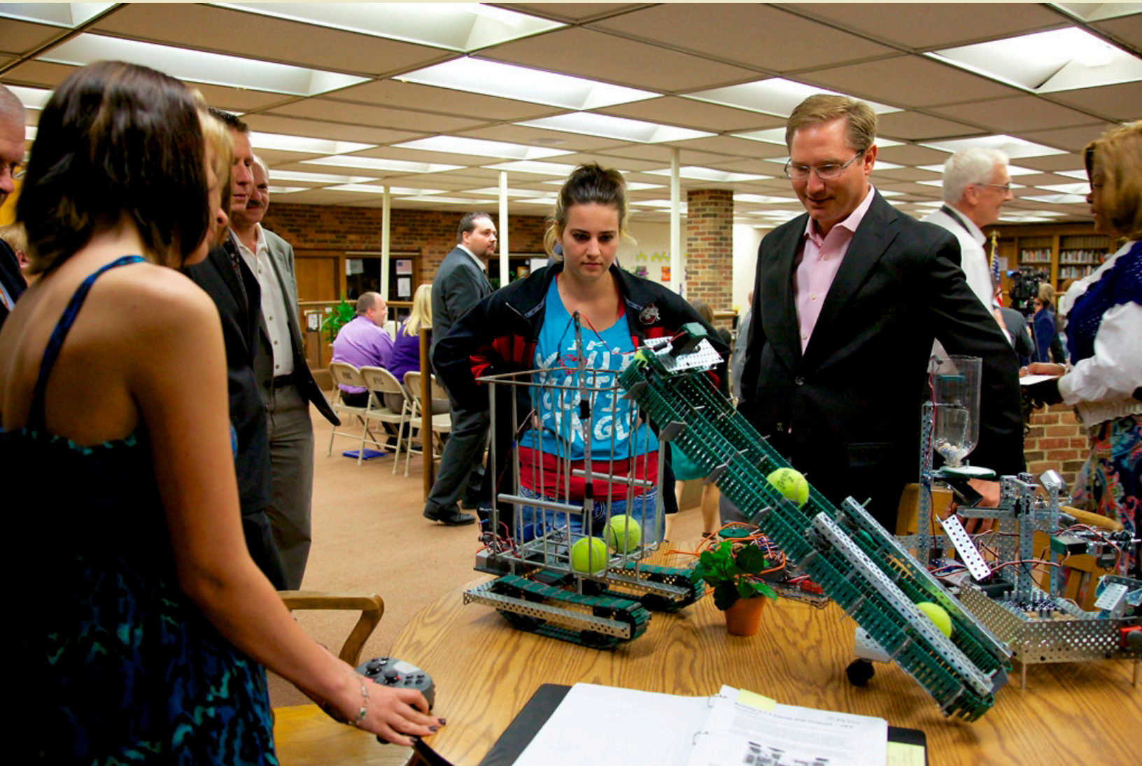
Engineering students at West High School in Columbus, Ohio demonstrate a student-designed robotic ball collector. The AEP Foundation-funded Credits Count SM STEM education initiative will roll out at West in fall 2014.