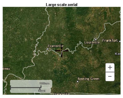
Back to Top

US Department of Commerce National Oceanic and Atmospheric Administration National Weather Service National Water Center 1325 East West Highway Silver Sprinn MD 20410