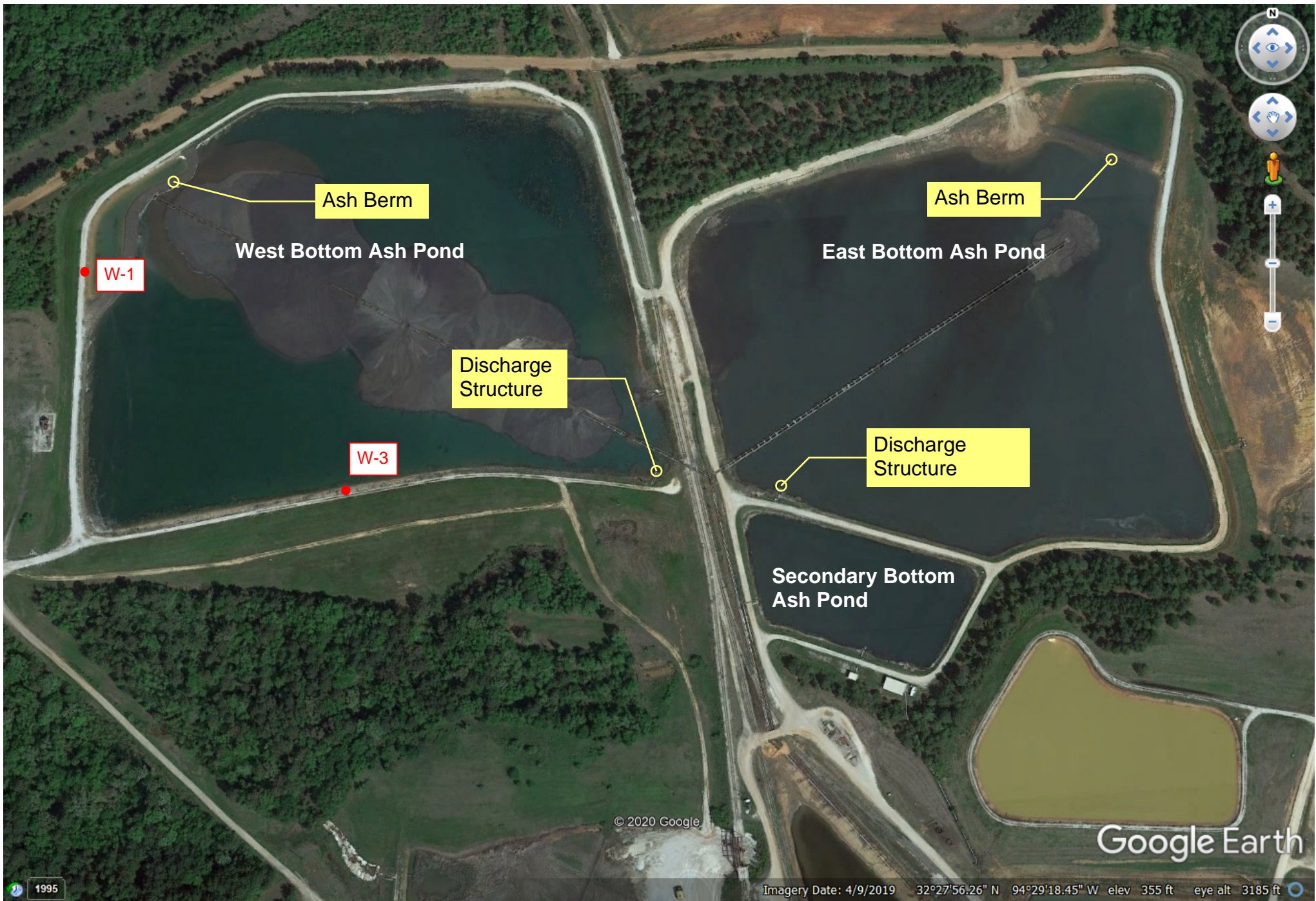
SITE MAP: BOTTOM ASH PONDS PIRKEY POWER PLANT