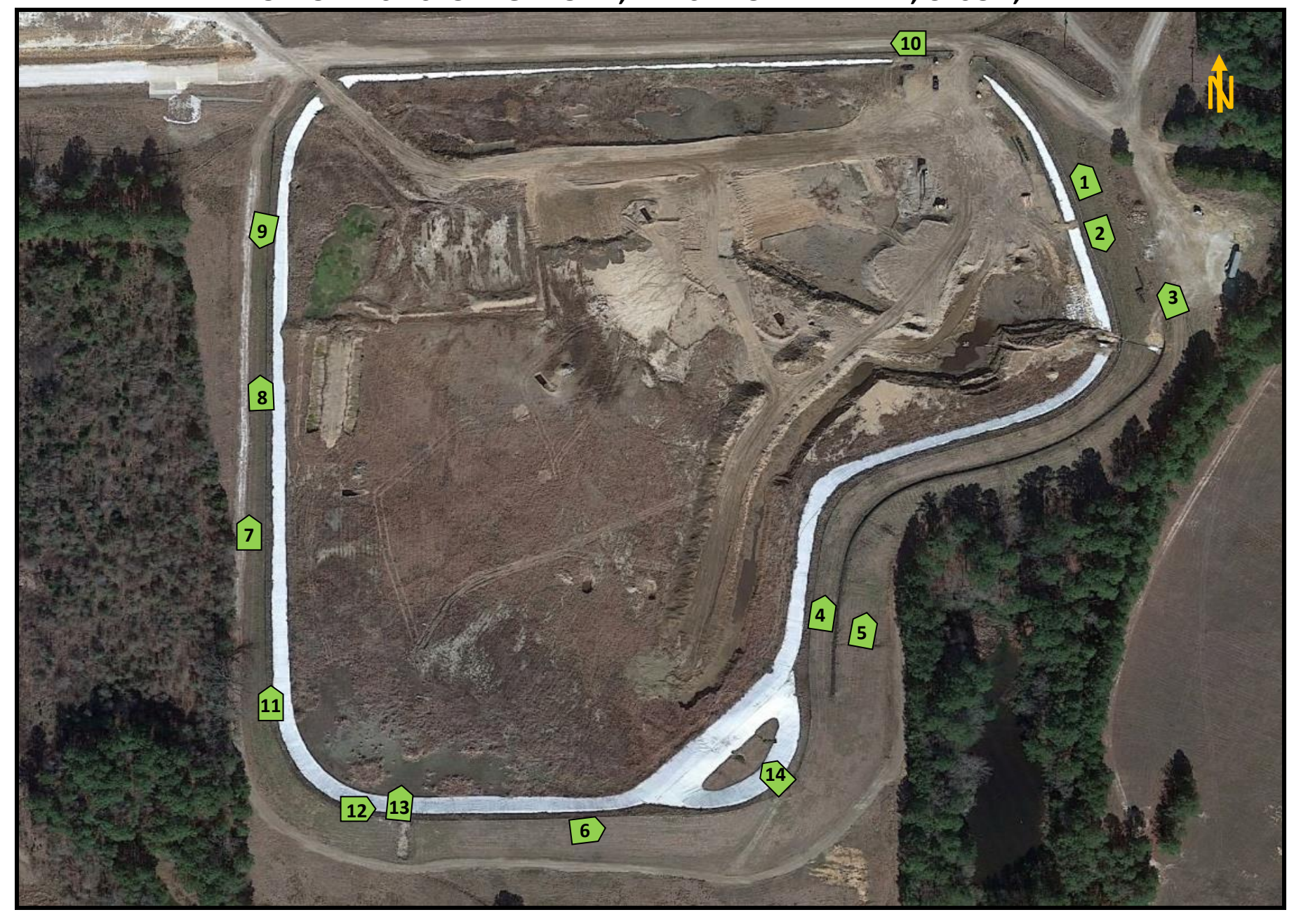
FIGURE 3 - PHOTOGRAPH LOCATION MAP BOTTOM ASH STORAGE POND, WELSH POWER PLANT, CASON, TX