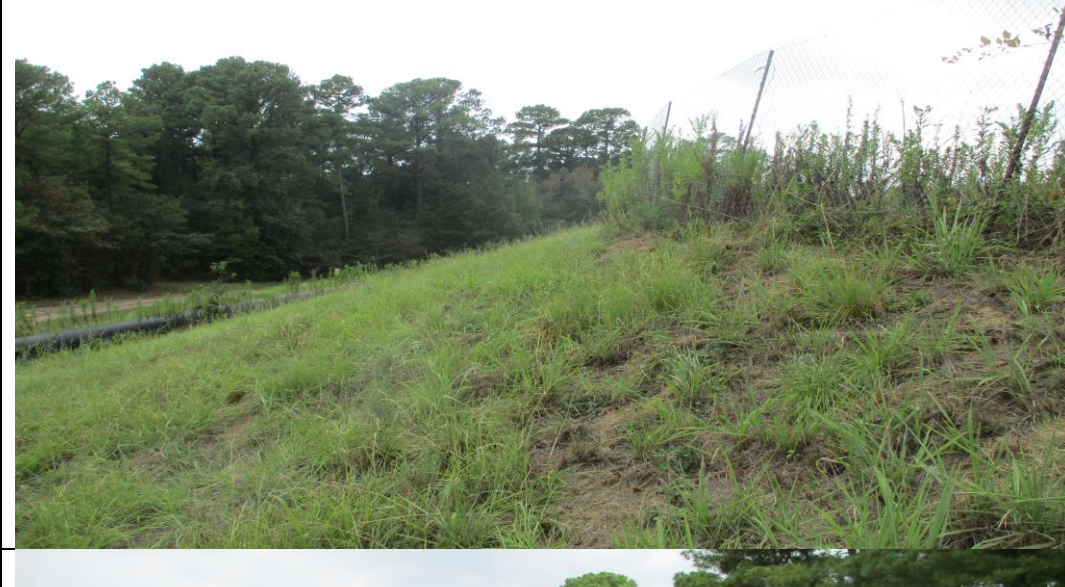
Photograph No. 3 View of the lower section of the downstream slope of the east dike (looking north).